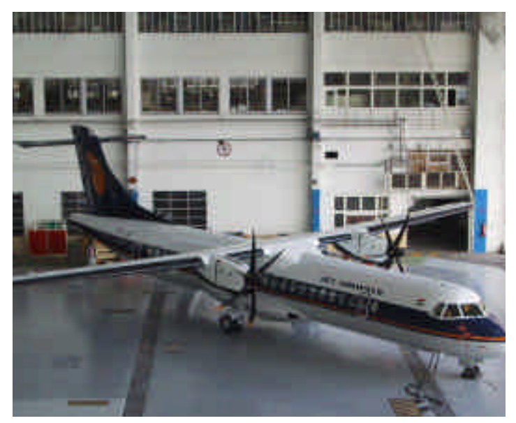
constructed before WWII, Airbus was able to assist by allocating one of their buildings to ATR.

With space acquired, ATR and Airbus now had the task of making that space suitable for manufacturing. Over 50 years of demanding wear and lack of maintenance left the concrete substrate in severe disrepair. Stonhard was selected from among five competitors who were each required to install a test patch. Stonhard not only engineered a flooring solution that could completely refurbish the existing substrate, but they surpassed EADS' expectations and requirements by providing a floor that would withstand the demands and rigor of an aircraft manufacturing assembly plant and would not impede production.